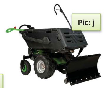
With opt: Snow/Agricultural Blade