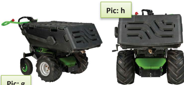
With opt: Skip risers and front