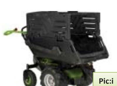
With opt: Skip risers