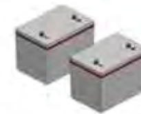
PURE LEAD BATTERIES