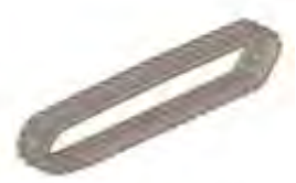
NO MARKING TRACKS