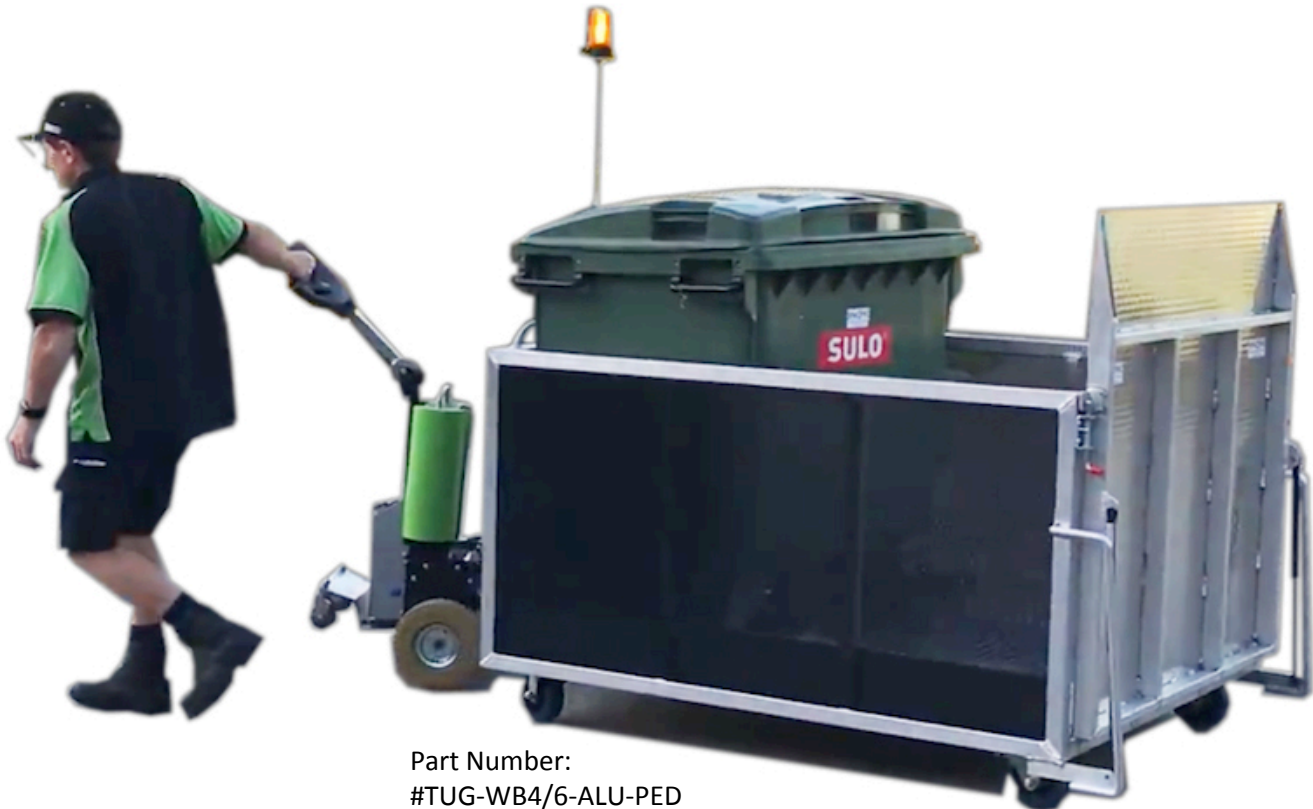
Part Number: #TUG-WB4/6-ALU-PED

The Multi Purpose Cage Aluminium Trailer is designed to suit most applications. Variations can also be manufactured specifically to your needs, please don't hesitate to contact sales@emoveit.com.au or call 1300 213 010