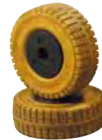
Optional No-Marking Solid Tyre Model: SM002