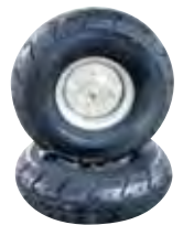
Optional Pneumatic Tyre Model: SM004