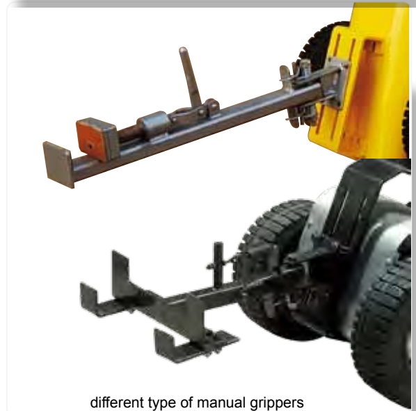
different type of manual grippers

SM1000N with optional No-Marking Solid Tyre Model: SM002