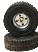
Standard Solid Tyre Model: SM001