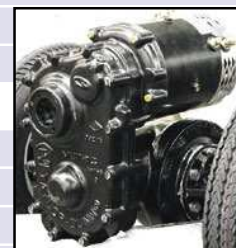
GT Automotive Drive